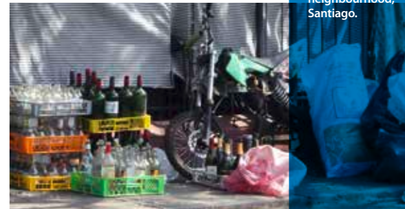
La Granja neighbourhood, Santiago.