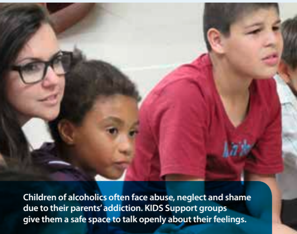
Children of alcoholics often face abuse, neglect and shame due to their parents' addiction. KIDS Support groups give them a safe space to talk openly about their feelings.