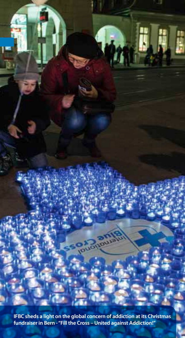
IFBC sheds a light on the global concern of addiction at its Christmas fundraiser in Bern - "Fill the Cross - United against Addiction!"