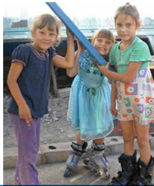
Children playing in the courtyard of the House Gawan in Mariupol, Ukraine.

has blessed us this year." When the big blue doors of the center close every evening and the children wander home, there remains something to look forward to for tomorrow.