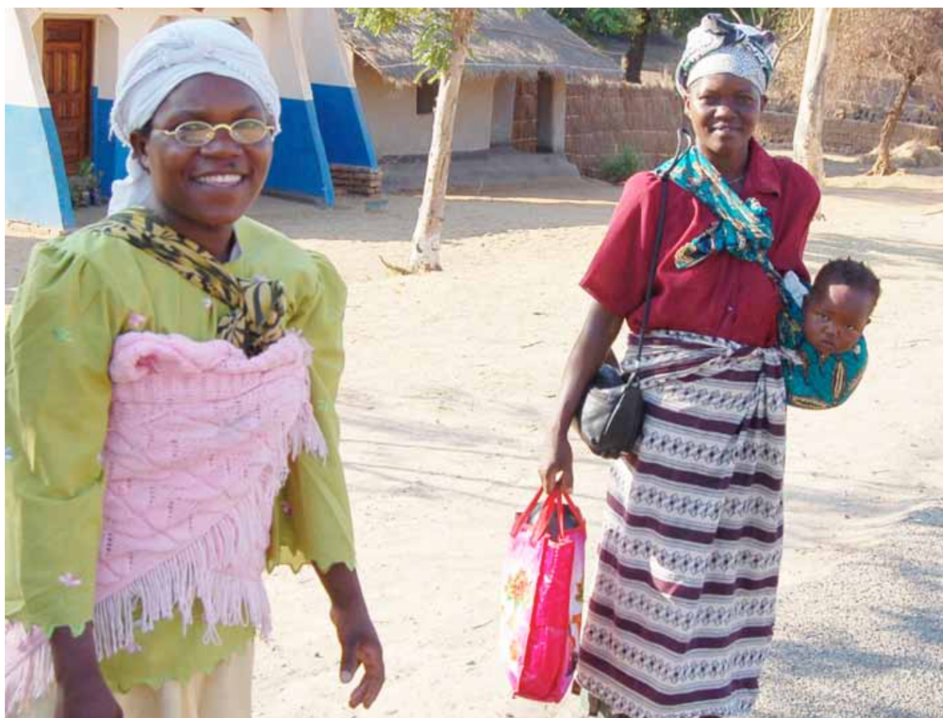
A society where effective strategies to prevent the harmful use of alcohol is implemented, will be a better society to live in for all.

WHO (2012), World Health Statistics 2012 , World Health Organization, Geneva 2012