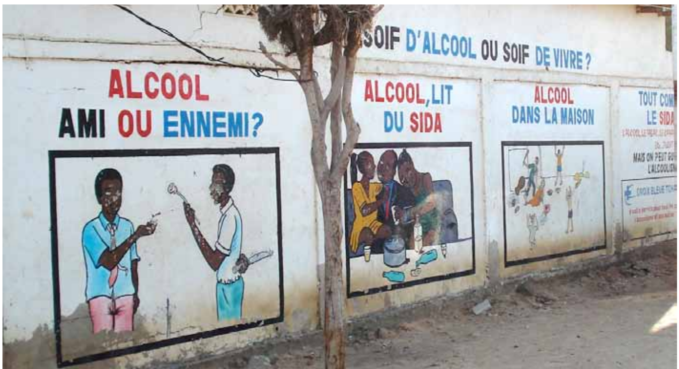
The harmful use of alcohol affects both the drinker and the non-drinker. Such harms can be prevented through the development and implementation of evidence-based alcohol policies.

Suggested methodology: Group discussions followed by plenary presentations. Divide the participants into groups of 4 to 5 people. Each group will then answer a set of questions (see above) by discussing them together (all groups will be given the same set of questions). After a break, the leader from each group will present the thoughts from their group. If possible it is good to have a flip chart available on which each group can write down the key findings before presenting.