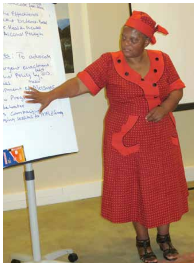
Learning about the most effective ways of preventing alcohol related harm, puts you in a good position to advocate for change. Here from a training in Lesotho in 2013.

Should you have any questions, feel free to contact any of us listed on page 4.