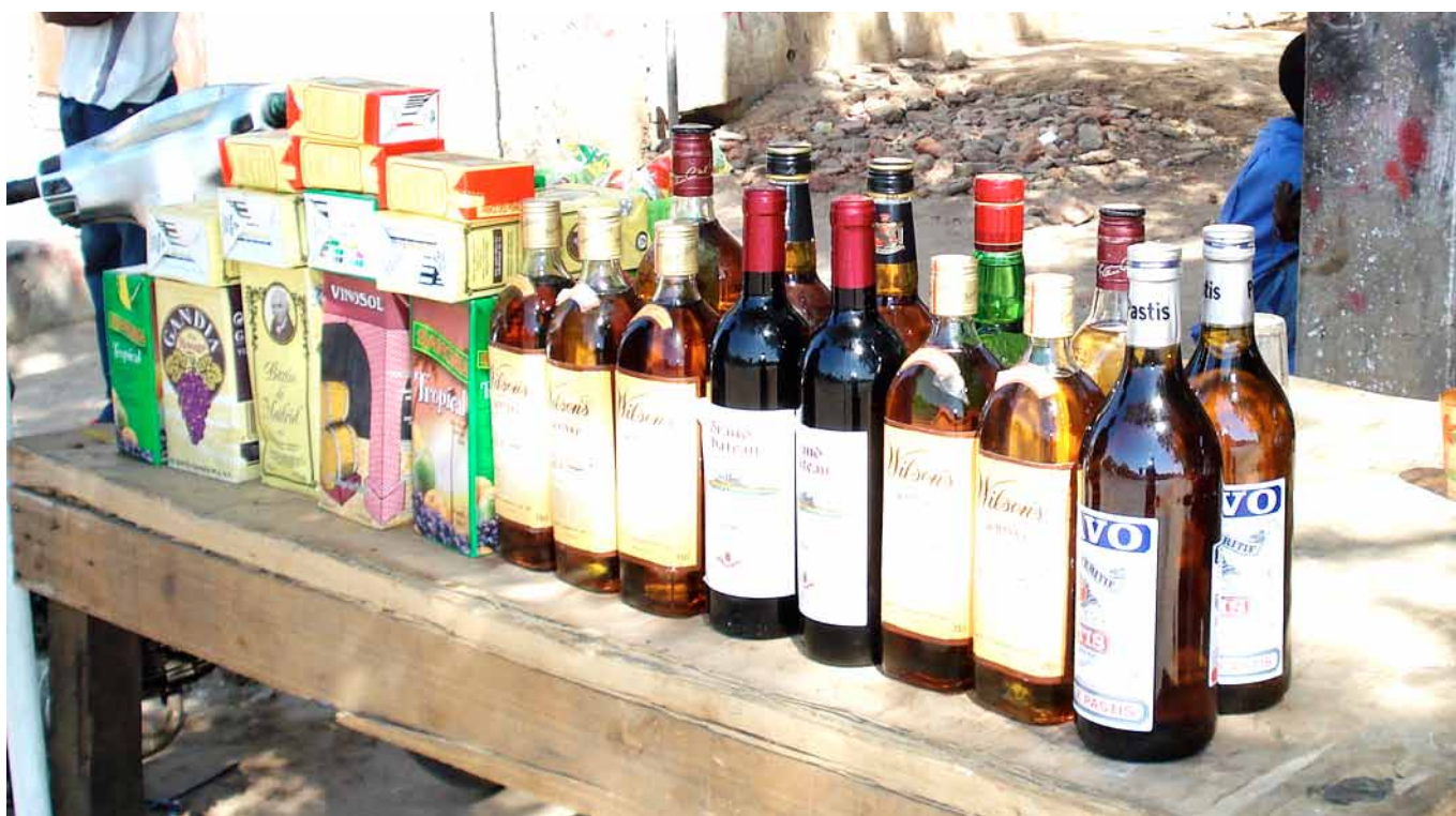
Unrecorded alcohol being sold by the main road into Chad's capital N'djamena. Interventions directed to legally produced and sold alcohol should be combined with actions to control the unrecordede market. (Photo: T. Saether).

Using the outbreaks of poisoning from contaminated alcohol as the bases for policy formulation overlooks the reality that alcohol, whether illicit or licit, contributes to widespread harm within a society. The contributions of both licit and illicit production should be considered in crafting alcohol policy. Of course, in regions where the unrecorded alcohol consumption is high, it should be taken into account when planning strategies and interventions to reduce alcohol-related harm.