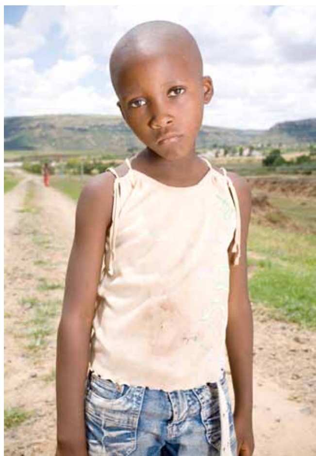
Children worldwide suffer under parents' harmful use of alcohol. This can be prevented and mitigated by the implementation of a comprehensive alcohol policy.

Report/PPT building on relevant data in the country.