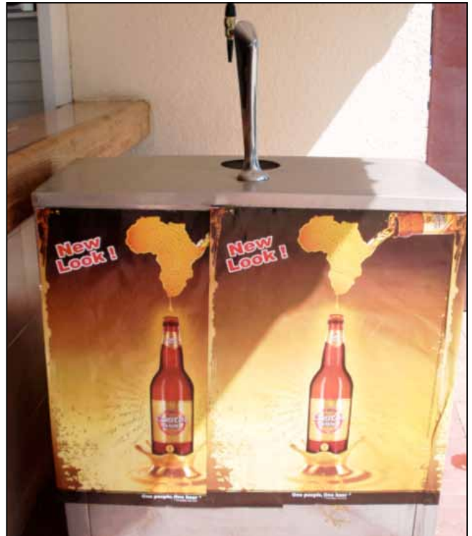
In recent years there has been an increase in alcohol consumption and heavy drinking occasions in many lower-income countries. Heavy marketing of alcoholic products contribute to this rise and should be banned or at least regulated. (Photo: T. Saether).

WHO (2011), Global Status Report on Alcohol and Health , World Health Organization, Geneva 2011