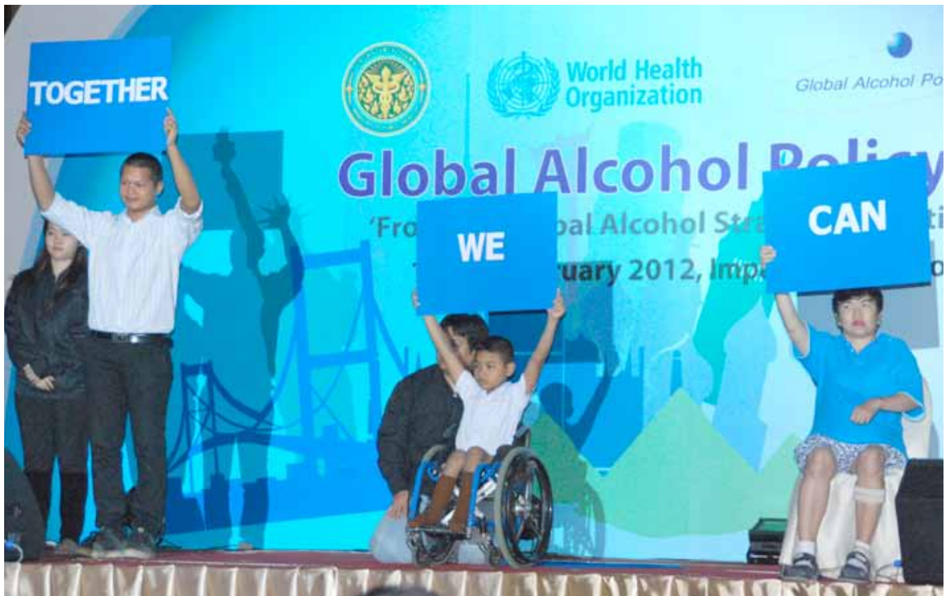
The key message at the Global Alcohol Policy Conference in 2012 was: We know how best to prevent the harmful use of alcohol – Now we must act!