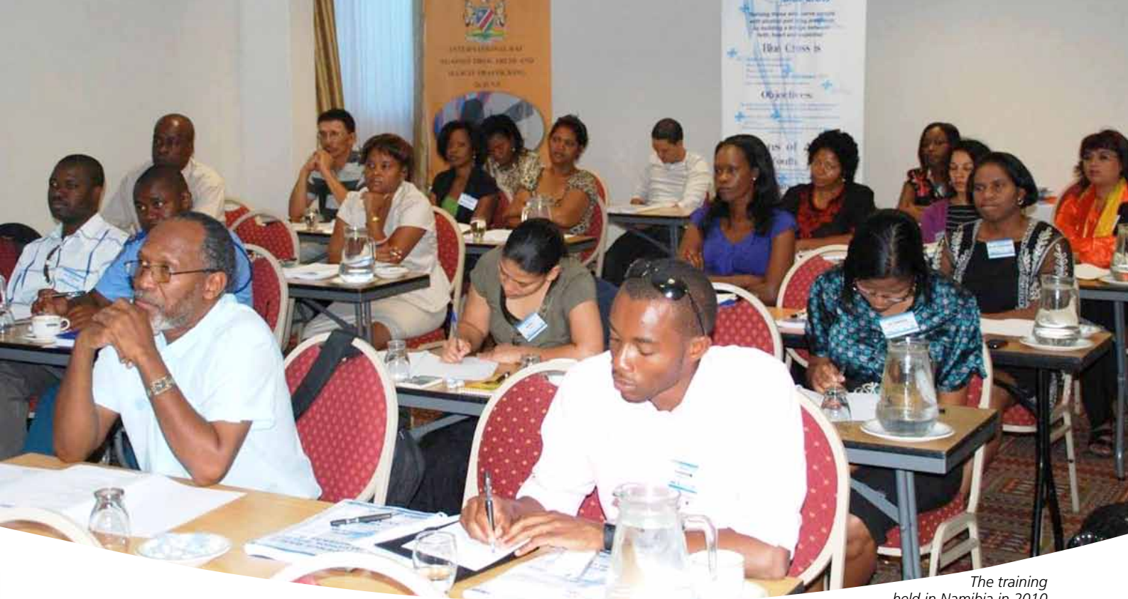
The training held in Namibia in 2010 hosted participants from several sectors. Cross-sector cooperation is key when developing and implementing comprehensive evidence-based alcohol policies.