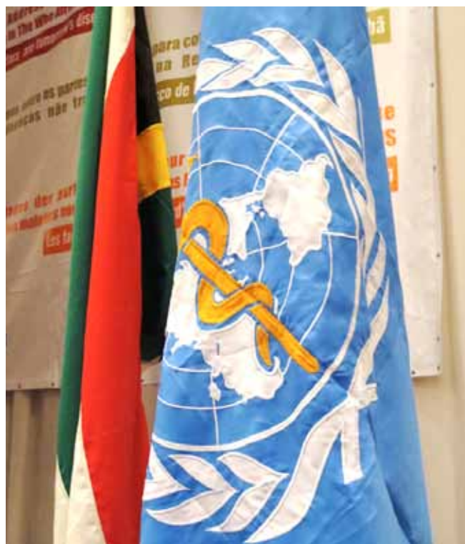
The WHO is a global authority on health.

Samarasinghe D. (2009), Unrecorded Alcohol , FORUT – Campaign for Development and Solidarity, Oslo, Norway, 2009